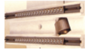
Table slides on 36 precision balls.