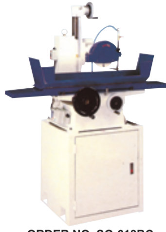
ORDER NO. SG-618BC