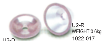
U2-D WEIGHT: 0.3kg 1022-013 CODE NO. 1022-013 Diamond grinding wheel CODE NO. 1022-017 Resinoid Diamond & CBN Wheels