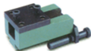
WEIGHT: 1.1kg CODE NO. 1022-012 U2-L Lathe tool grinding attachment